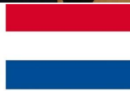
Stamppot (Dutch National Dish)